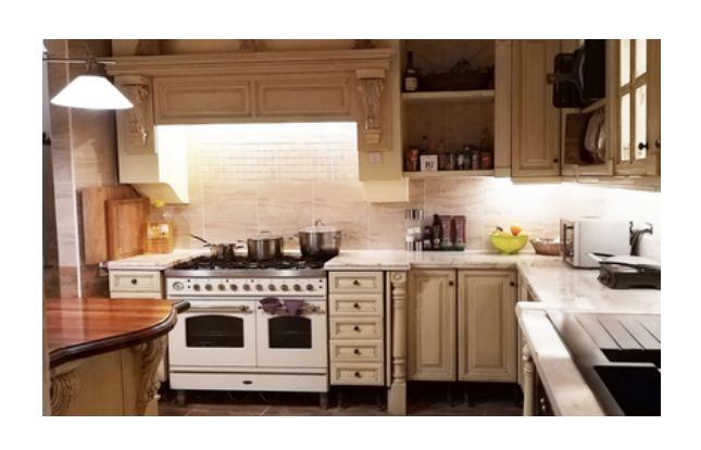
DAY 3 - 3RD OF JUNE 2024

Breakfast from 8 am to 10 am Introduction to the quest of self-discovery with Krisztina. Journaling, reflection Lunch at 1 pm followed by relax 1st activity outside (itinerary subject to change*) Dinner upon return Evening Relaxation with Enolia