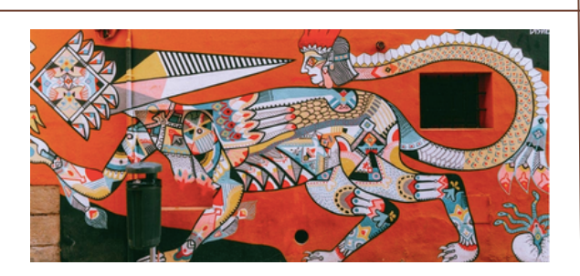
DAY 8 - 8TH OF JUNE 2024

Lunch at 1 pm followed by relaxation Dinner from 7 pm to 9 pm Retreat Closing Circle with Enolia - fire ceremony